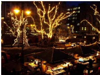
Christmas Fair in Budapest