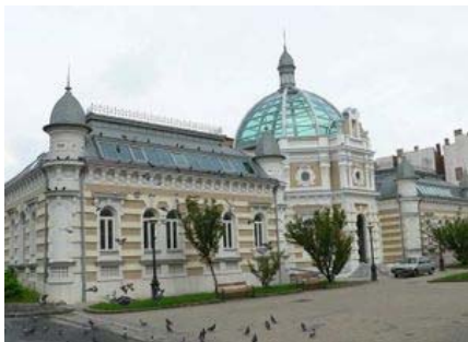
Miskolc Erzsébet spa