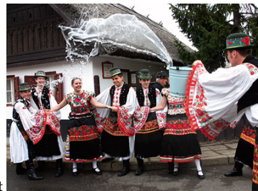
Traditional Hungarian Easter Sprinkling