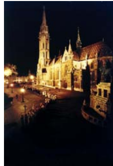
Church of Saint Matthew, Budapest