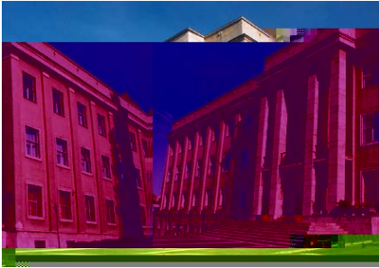
University of Pannonia

University of Pannonia: http://englishweb.uni-pannon.hu/