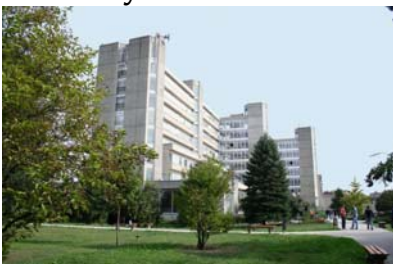
Széchenyi István University

Széchenyi István University: http://www.sze.hu/siueng/