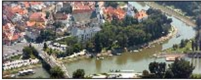
Bird's eye view of Győr