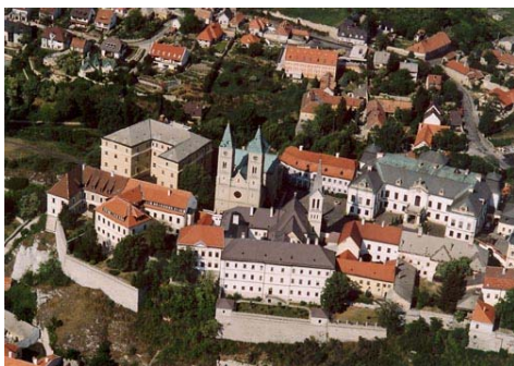
Bird’s eye-view of Veszprém

Built on seven hills, on the two sides of Séd creek, the “City of Queens” is a prosperous town in the Transdanubian region offering more and more cultural programmes every year. Veszprém is only 15 kms from Hungary’s biggest lake, Lake