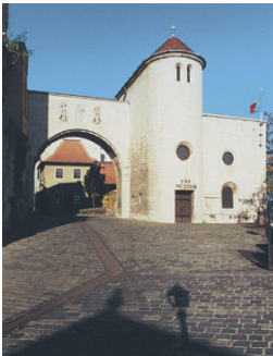
Entrance to Veszprém Castle