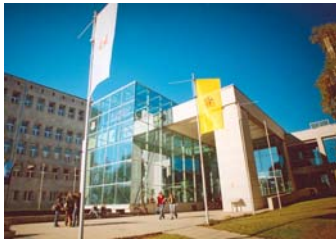
University of Miskolc

University of Miskolc: http://www.uni-miskolc.hu/public/