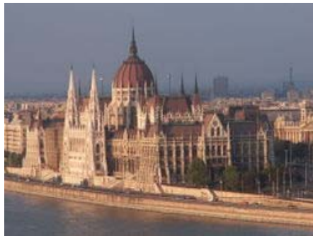
The Hungarian Parliament, Budapest