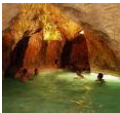
Miskolc Tapolca Thermal Bath and Spa