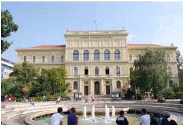
University of Szeged

University of Szeged: http://www.u-szeged.hu/english/