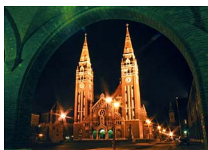
Votive Church, Szeged