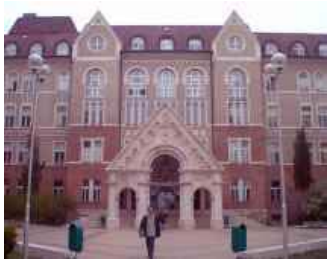
University of Pécs

University of Pécs: http://english.pte.hu/