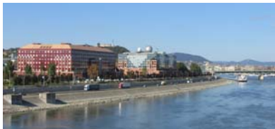
Eötvös Loránd University

Budapest University of Technology and Economics: http://english.www.bme.hu/