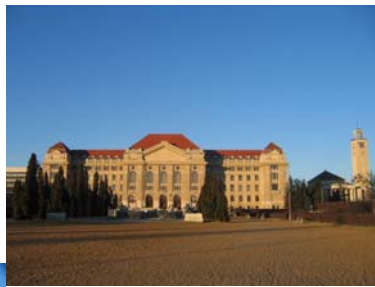
University of Debrecen

University of Debrecen: http://www.unideb.hu/portal/en/