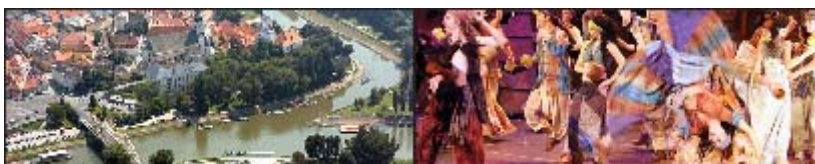
Bird's eye view of Győr