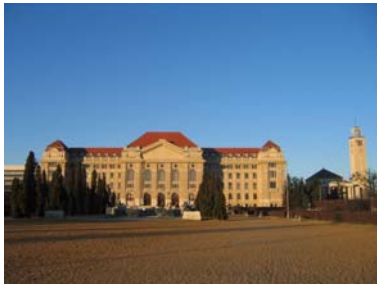
University of Debrecen

Wide streets, spacious squares, the Reformation Cathedral - situated in the North of the Hungarian Great Plain, Debrecen is the second biggest city in Hungary often called the “Calvinist Rome”. It has been the home town of several famous poets, and also the second home for lots of students. The Hortobágy National Park, where you can find the biggest “puszta” with its special flora and fauna, is only a stone’s throw away from the city.