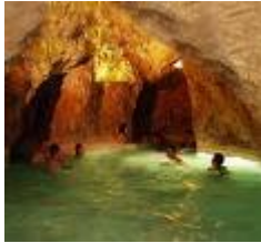
Miskolc Tapolca Thermal Bath and Spa