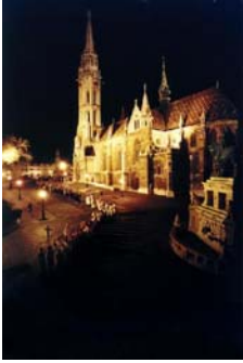
Church of Saint Matthew, Budapest