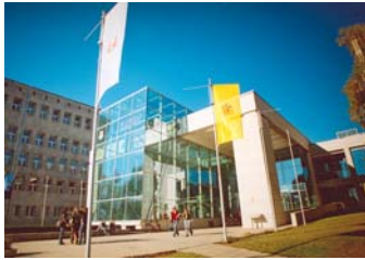
University of Miskolc

university, the campus and the sport facilities are surrounded by a large park in a nice surrounding.