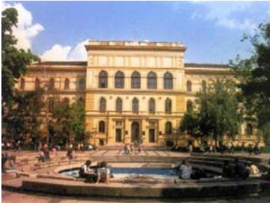
University of Szeged

Fascinating streets, beautiful squares, and the shore of the Tisza are perfect scenery for the unforgettable schooldays in Szeged. The city of sun is rich in cultural programmes, festivals, let alone its lively weekdays with the cosy pubs and clubs designed especially for students.