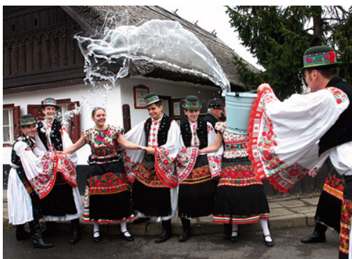
Traditional Hungarian Easter Sprinkling